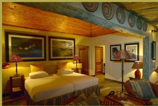
Mashatu Main Camp