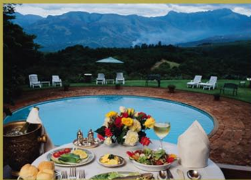
The Coach House