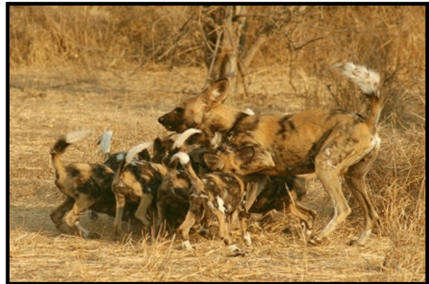
Below: Kalahari feeding some of the pups

The pups are now three months old and are becoming very mobile. Recently they started with short excursions from the den. During the day, much of their time was spent in the Limpopo riverbed. Here they would play and lie around in the shade of some large trees. The adults would go out early and late to hunt and bring food back to the pups.