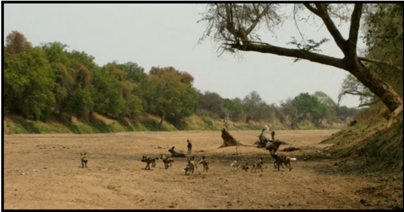
Above: pups playing in the Limpopo riverbed

After spending a full three months at the den, the entire wild dog pack moved out on Sunday. Seeing 25 wild dogs moving through the bush together is quite an impressive site! They headed in a northerly direction and made their way up to Pole Hill. They used this hill as a base for three nights and early this morning they headed back down towards the Limpopo River. On Monday evening they caught an impala ewe within 45 minutes of going out hunting. This was right next to Pole Hill. It was great to see the pups on a kill for the first time.