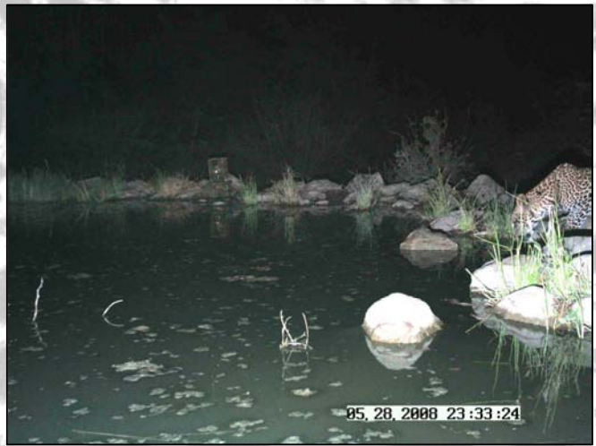
Pictures from camera traps set in 2008, all from the same male leopard.