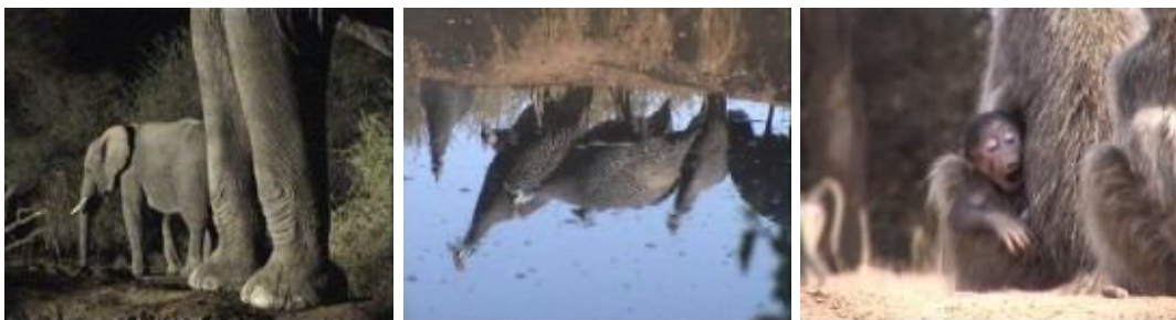
The pond is a beautiful place, but on a cloudy day, with the sun peeking through, it becomes stunning