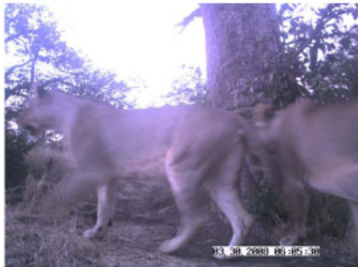
Picture taken by a camera trap set out in the bush.

The 6 'new' lions that moved into the area were seen regularly, but although all 6 were seen together, most often they break-up into two small groups of 3 each. They are very relaxed and guests have great opportunities to take some stunning pictures of them. The two males are still mating on the odd-occasion with the younger two females, but the best sighting of them was when they killed a wildebeest next to the Majale River and we could watch them feed at their leisure while there were wary hyenas lurking in the background.