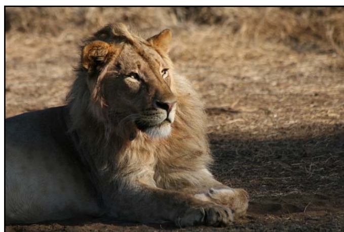
One of the young male lions

The New Pride was found almost every day and there were three eland kills made by these lions during the month. The adult female from the Majale Island Pride was again seen after being 'absent' since January this year. One of the adult females from the New Pride was seen chasing and fighting with this female and it is believed that the Majale Island Pride female is coming into heat again and is seeking out one of the very few male lions around.