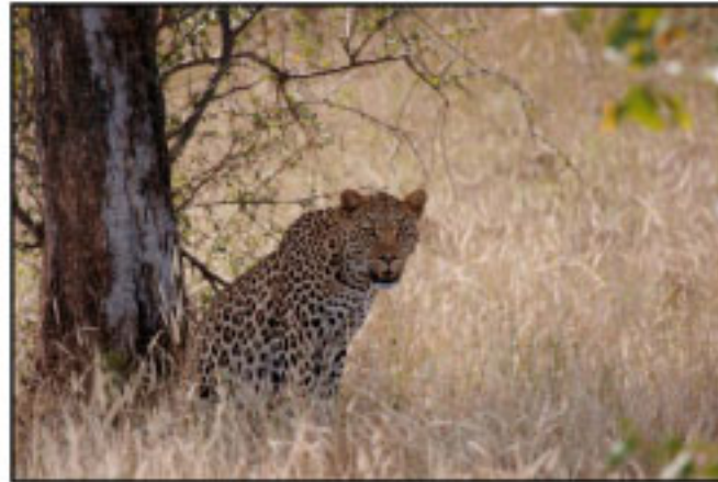
One of the young male leopards seen often.