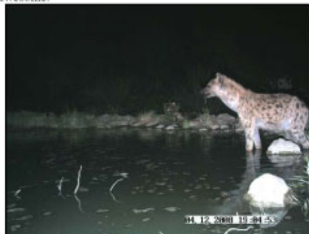
Spotted hyena drinking at Naledi waterhole.

There's a new spotted hyena den located just down-stream of the Majale Cocktail spot along the bank of the river. These amazing predators are seen most often and if they are not seen you are sure to hear them calling at night. They are fairly abundant and although they are not the most beautiful predators around, they sure are wonderful to watch and their whooping calls are just awesome!